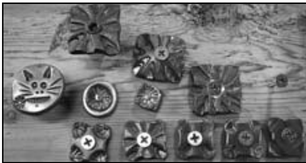
Sample pieces made using various tooling. Two are knobs for drawer or cabinet doors, the cat and knob at the top.

These used punches were bought at a blacksmith conference for a buck apiece. I pigged out and bought about 50, knowing they would be useful for fly press tooling even though the press hadn't been set up yet. Some of these have been reshaped by grinding. The punch shanks are 1" in diameter. My favorite press tools are teardrop, round, square, rectangular, domed and cone shaped. One has been ground for a walking chisel shape.